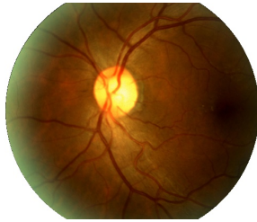
ONH Centered [OS]